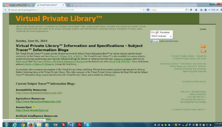
Figure 2: Virtual Private Library™